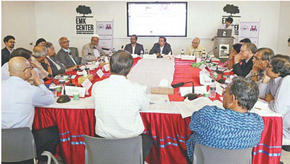
Analysts take part in a roundtable on energy security and future challenges at EMK Centre in Dhaka yesterday.

Analysts say government must pay attention to primary energy