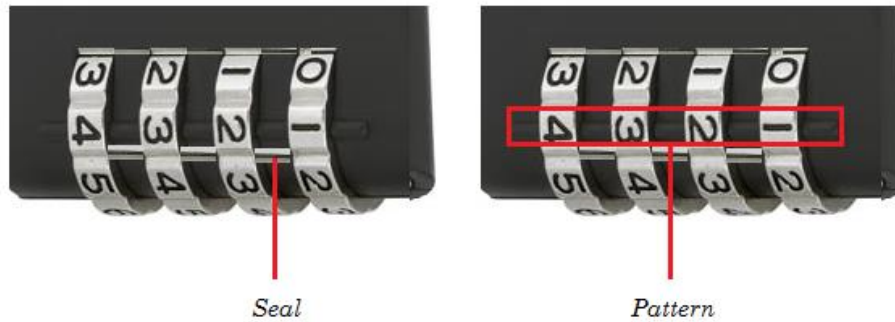
Figure (a): Password Protected Pattern Lock

More than 80 Million US Dollars was stolen from ABC Central Bank last year. The board of directors of Bank ABC investigated the whole thing but they ended up with no conclusion. "This was inevitable and it was due to the demerit of the Internet"- one of the directors had commented publicly. Being criticized by the investors after these entire unpleasant incidents, Bank ABC decided to introduce Password Protected Pattern Lock to add an extra safety mechanism.