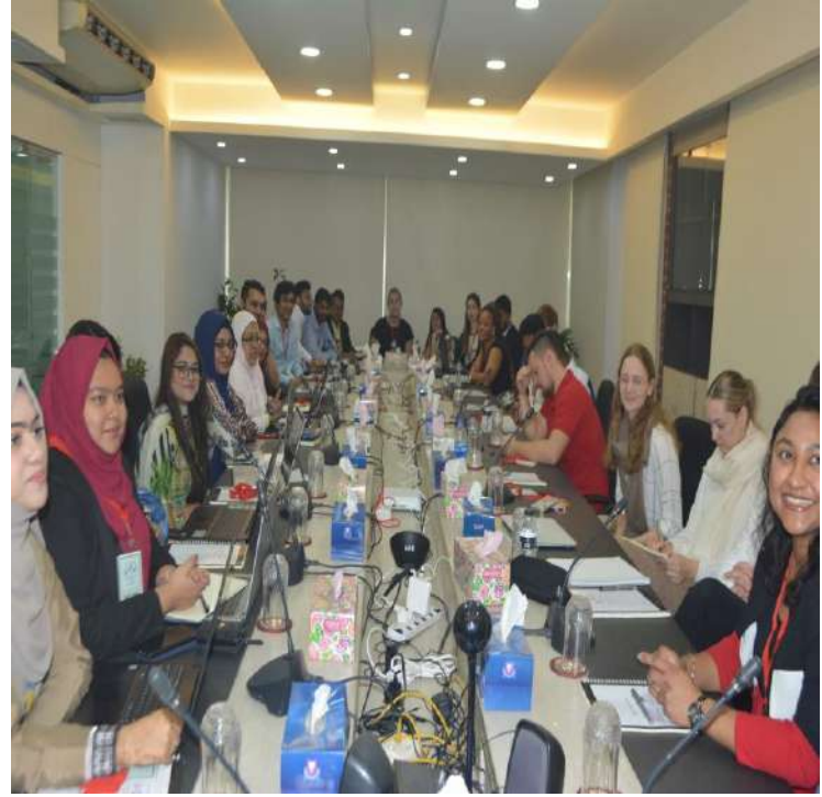
Class with German Professors