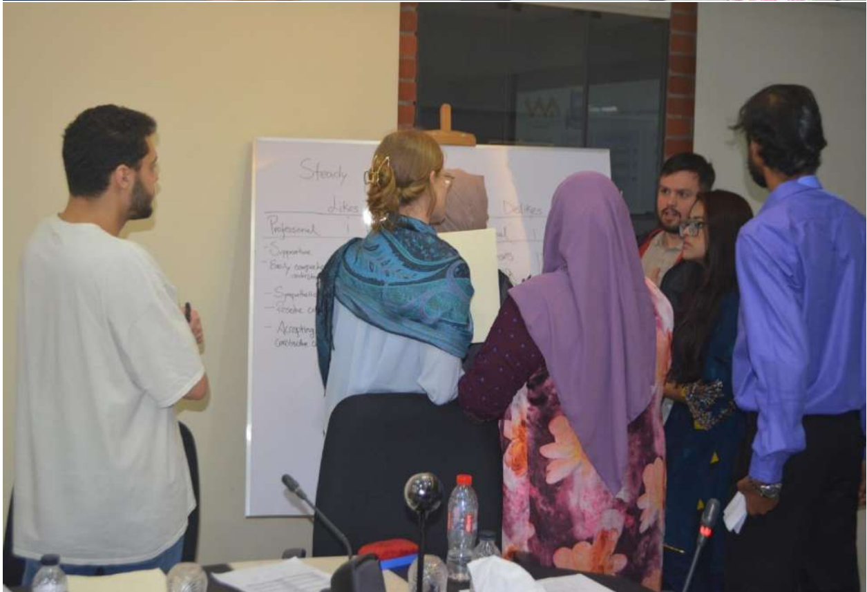
The group task