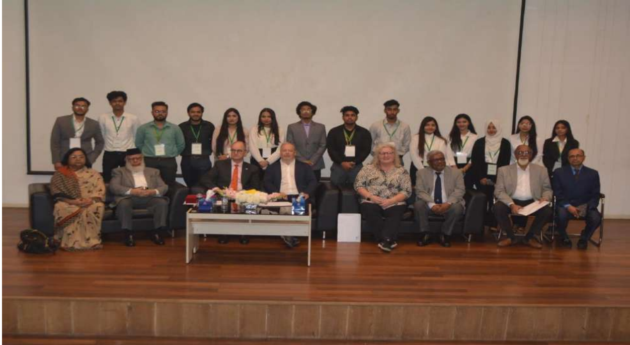
The special guest with the volunteers at the inaugural ceremony

Day 01-At UAP plaza February 12: 9:30 AM to 10:45AM- The Morning Session