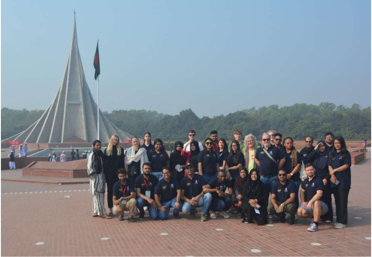
The monumental Shritishoudho