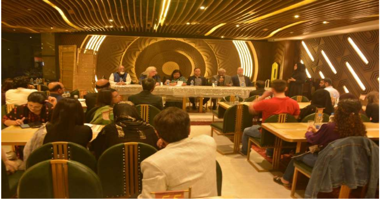
The certificate giving ceremony