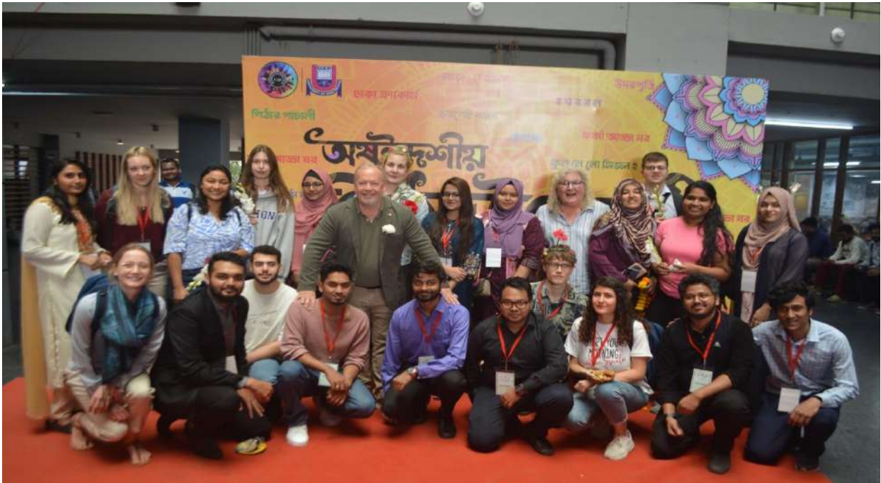
Afternoon soiree: In the afternoon students enjoyed a colourful fair at the UAP plaza.