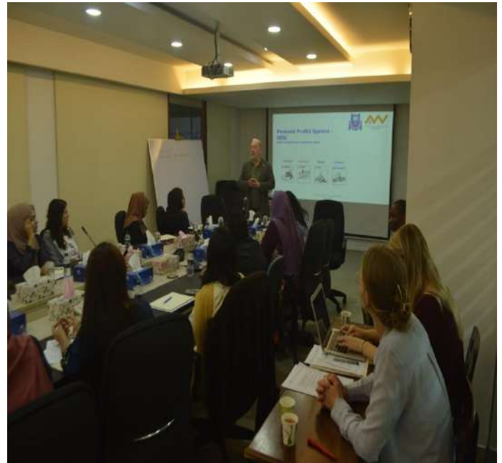
The teaching contents