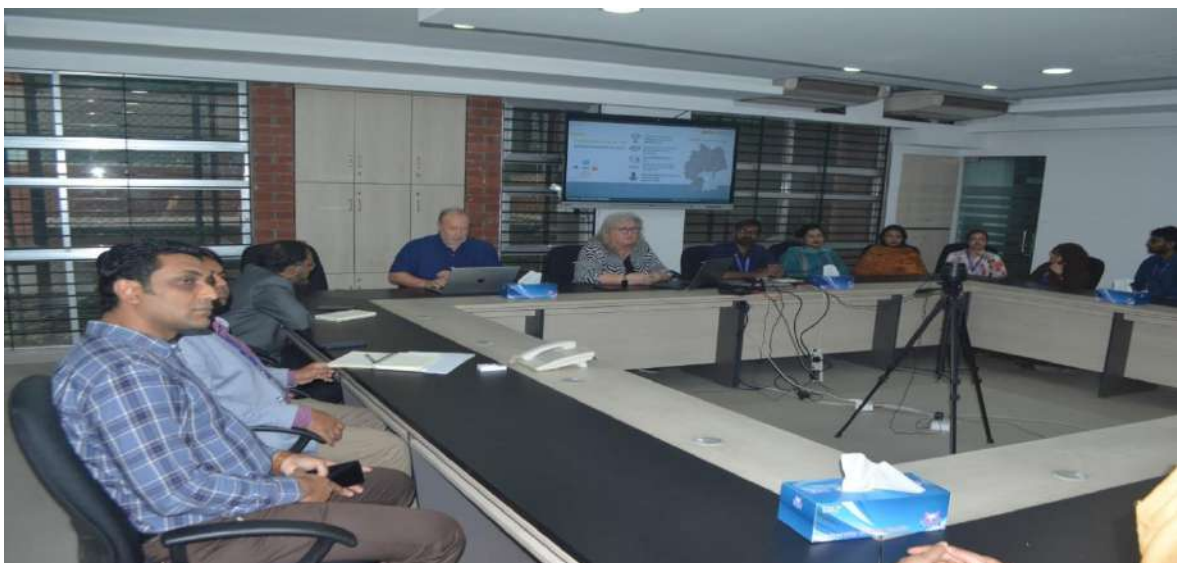
Familiarization Session with faculties of DBA,UAP