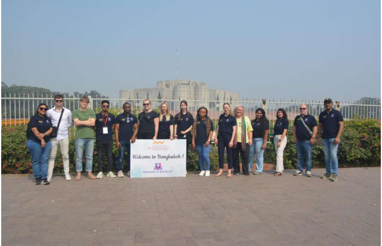
The parliament stands tall