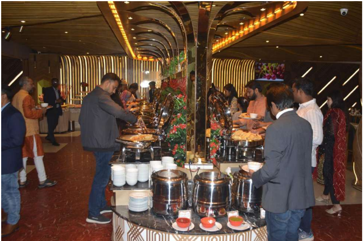
The Sumptuous dinner