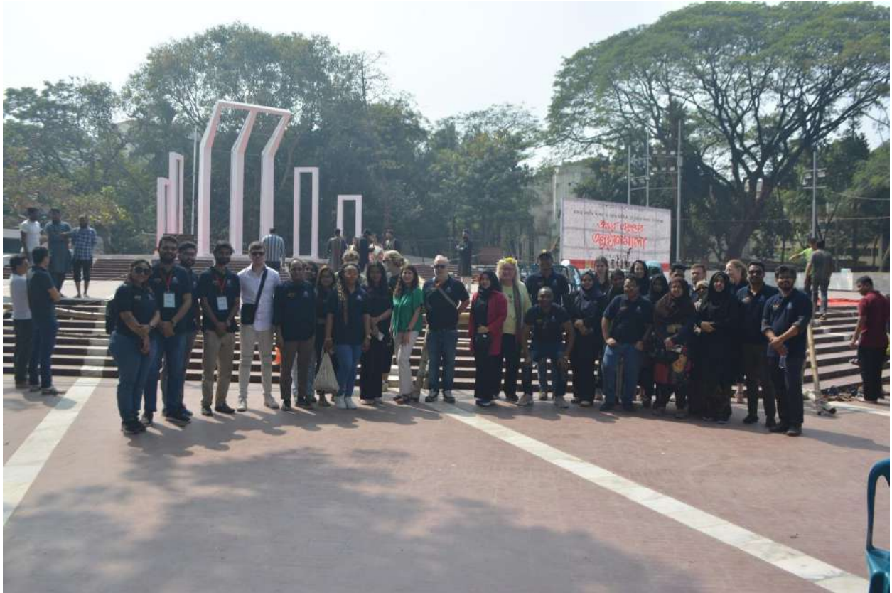
A visit to honor the martyrs-The Shahid Minar