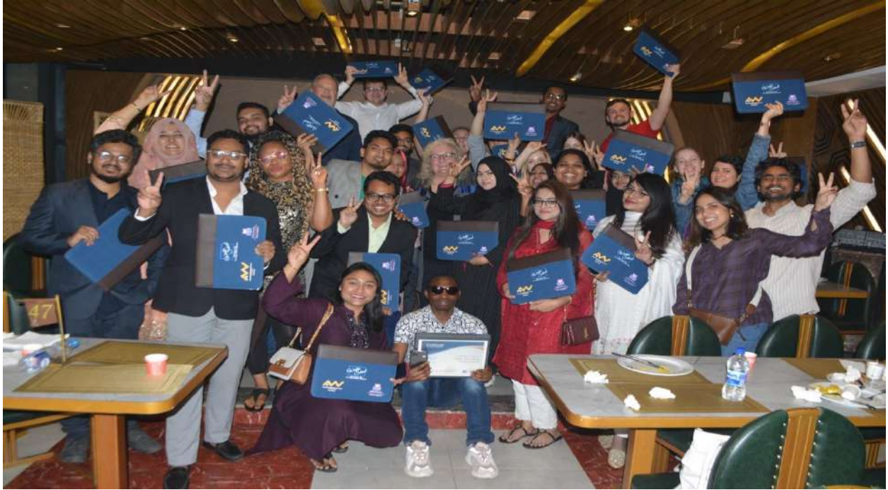
The jubilant graduating students –winter school