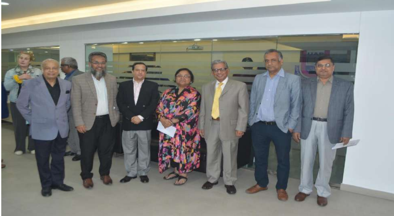
Discussion session with the Board of Trustees, Pro-VC and Head of Depts., UAP