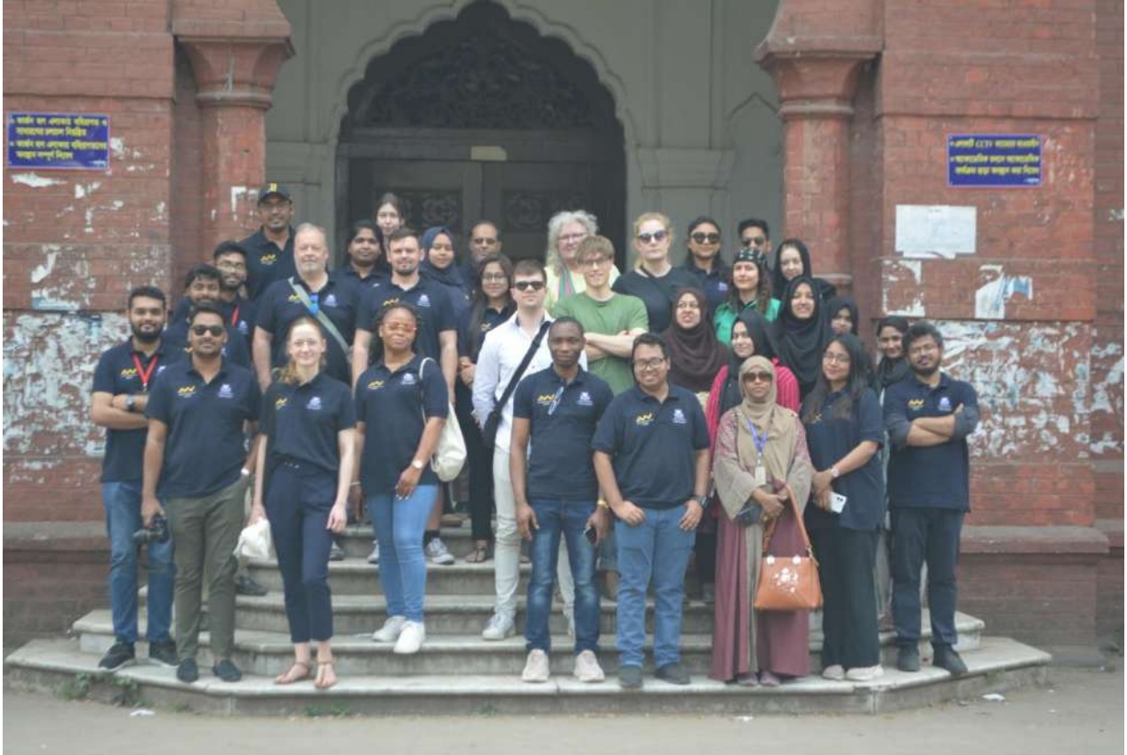
A visit to the once –Oxford of the East-Dhaka University: Curzon Hall