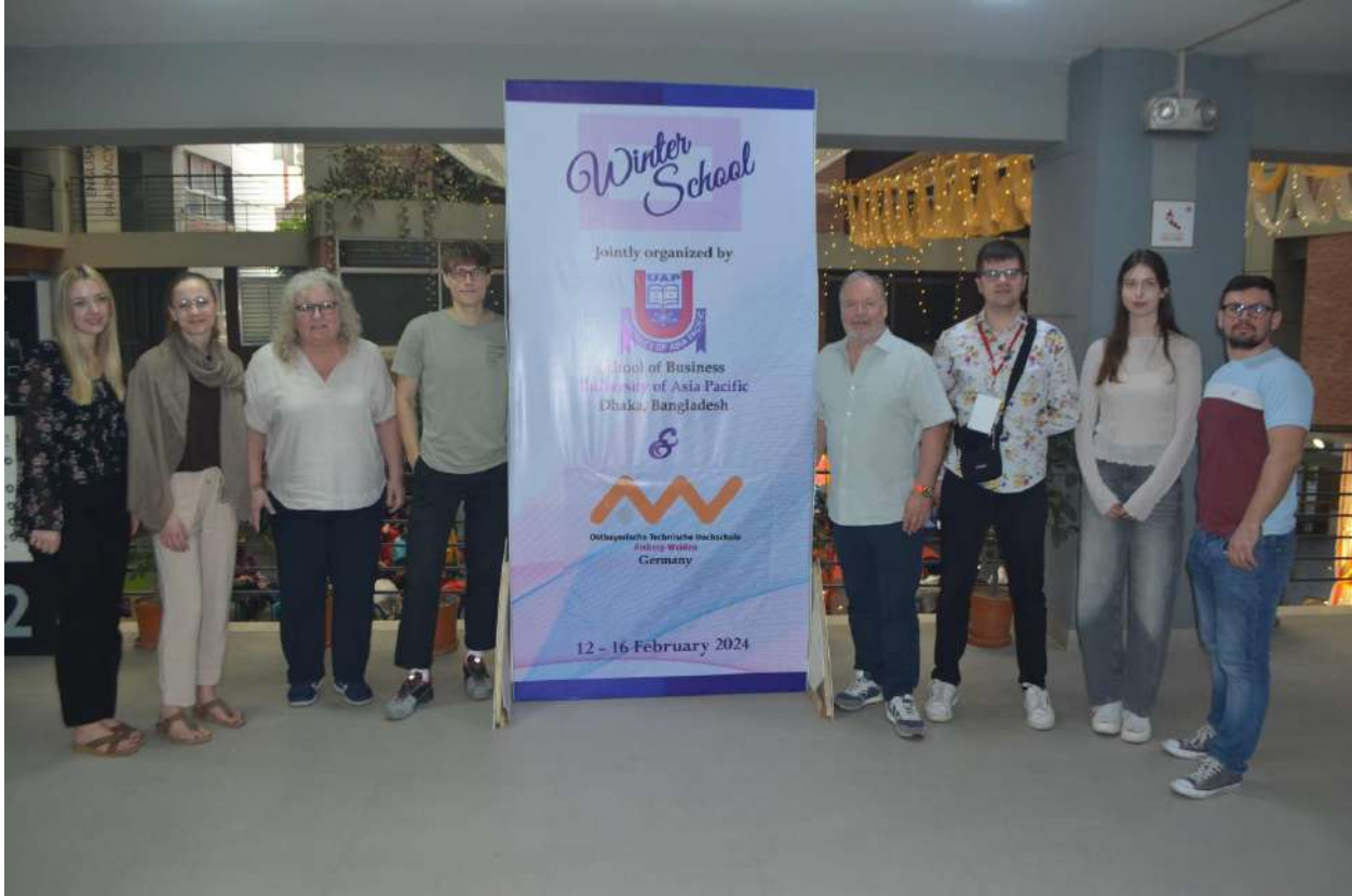
The Winter School Class mates