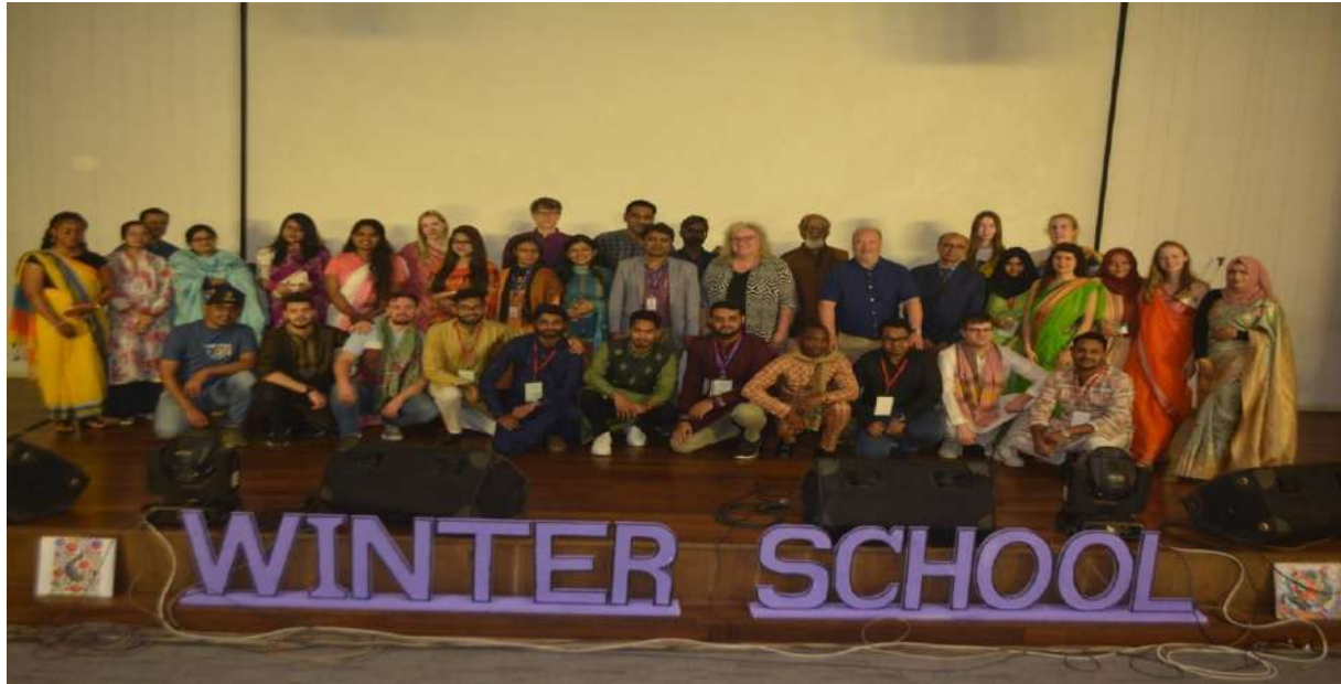
The creative ensemble

Cultural program organized at the auditorium by Cultural Club, Department of Business Administration where students of UAP as well as OTH showcased their heritage, culture, language via popular folk, contemporary; songs, dances, oration and even a football match.